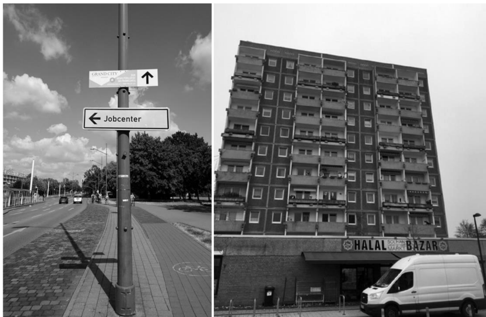
Figure 3. The job centre sign in Halle, Südliche Neustadt, and an Arabic supermarket in Mueßer Holz/Neu Zippendorf (Schwerin).