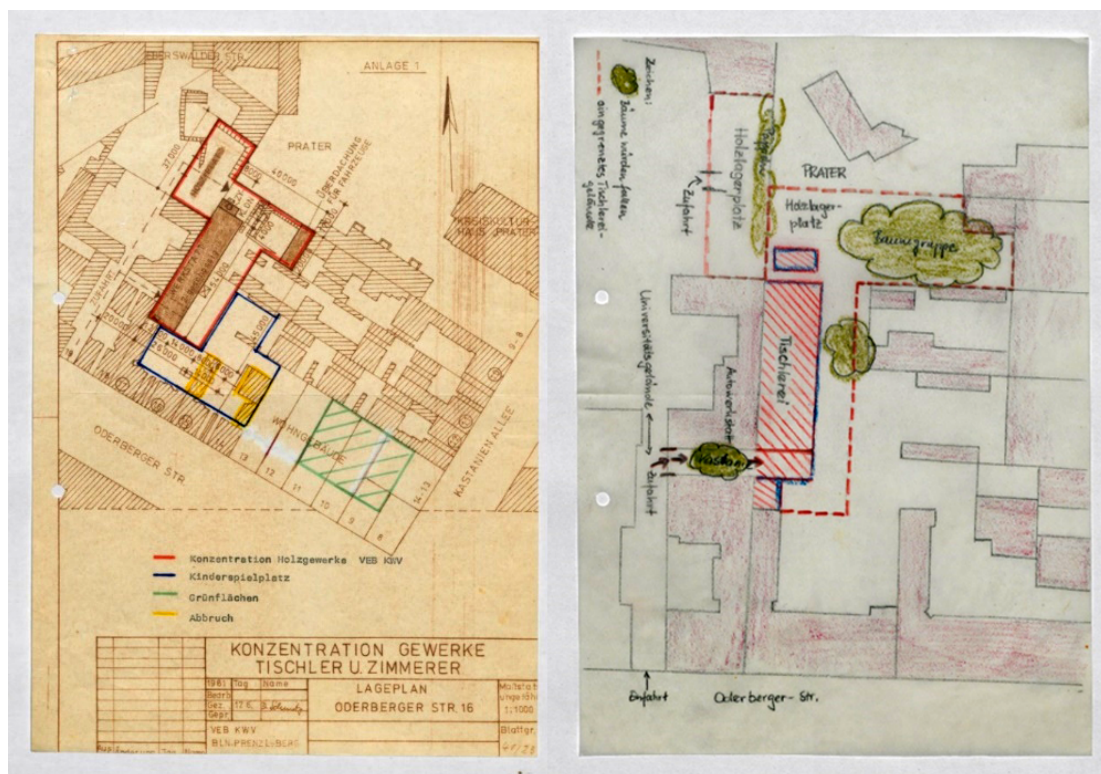
Figure 1. From left to right: Maps for the backyard conversion designed by planning authorities and neighbourhood actors.

Subsequently, the intense commitment of the neighbourhood initiative in written and visualised forms led to the adoption of more transparent practices in the state's planning procedures: first, by letter correspondence, and second, through dialogue formats, such as