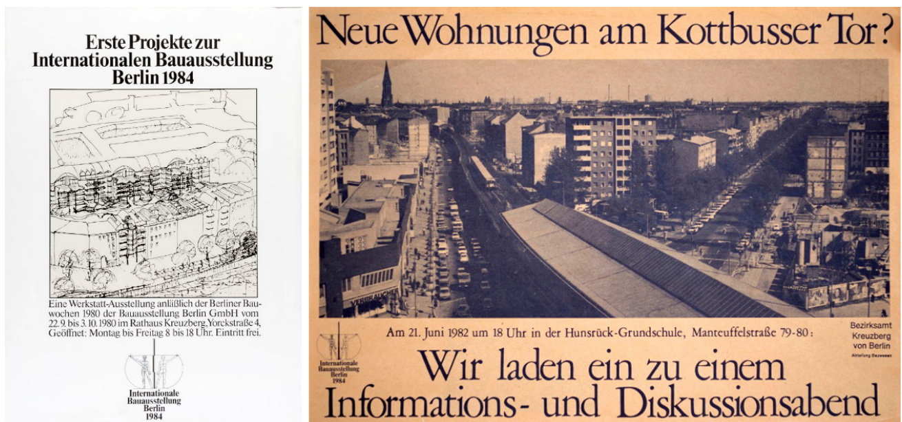
Figure 3. From left to right: Posters of the international planning exhibition in Kreuzberg inviting the public to a workshop exhibition in 1980 and an assembly in 1982. Sources: “First Projects for the International Building Exhibition Berlin 1984” (1980) and “New apartments at Kottbusser Tor?” (1982). Image rights: S.T.E.R.N. Gesellschaft der behutsamen Stadterneuerung mbH.

Adapting the prior mentioned legal planning regulations in designated areas, a comprehensible and citizen-