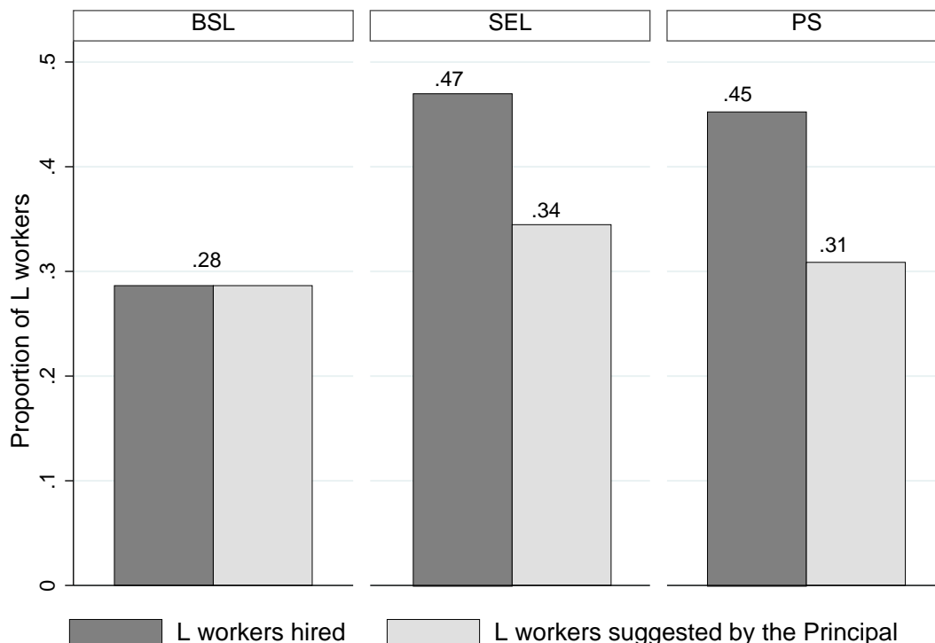
Figure 1: Proportion of L workers suggested by the principals and hired by the agents across treatments

henceforth): 12 Agents' hiring decisions : BSL vs SEL: z = 2.05 , p = 0.02 ; BSL vs PS: