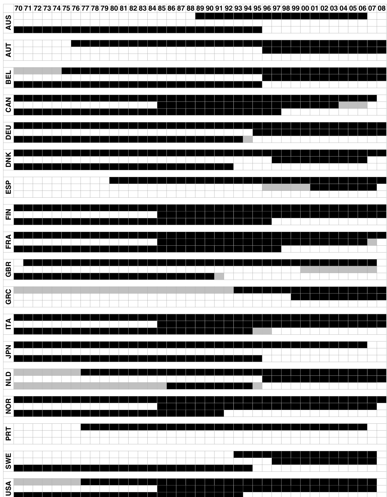
Fig. 2 Sectoral productivity data coverage. Notes: For each country, the first row describes the coverage span of the STAN data set; the second, the PDBi; and the third, the ISDB. If all six sectors are available, the line is drawn black , if some sectors are available, it is drawn gray . The STAN data set covers the broadest range of the three data sets