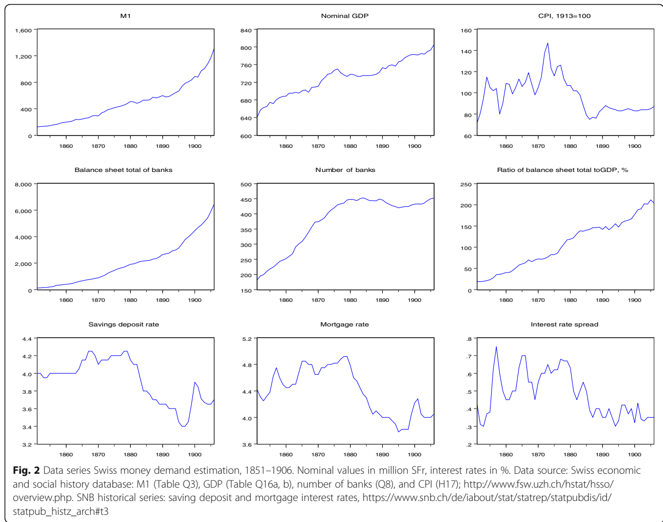
Table 1 Unit root and stationarity tests, 1851–1906