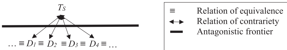
Figure 2. Schematic illustration of a vertical equivalential discourse.

The contrast here to Figure 1 is telling: there is now a concentration of contrarities around the opposing element T_S , such that the popular demands on the protagonist side of the antagonistic frontier are not defined in terms of autonomous contrarities of their own prior to their equivalential unification in common contrariety against the Tsarist regime. It is here that a distinctly vertical logic of representation can be seen: namely, the simplification of antagonism around empty signifiers ('people' vs. 'power') – in this example, the Tsarist bloc T_S as an empty signifier that (from the perspective of the 'popular' discourse) concentrates all the opposition to the 'popular' side around itself and thus comes to represent the opposing side in its entirety (following here Nonhoff's (2006, 2017) operationalization of the empty signifier as the element that has relations of contrariety with all elements of the opposing equivalential chain). In empirical reality, to be sure, things are more complex and differentiated: the Tsarist bloc T_S is itself constructed in equivalential terms by the 'popular' discourse – with distinct elements such as 'nobility', 'clergy', 'military', etc. forming an equivalential chain around a unifying