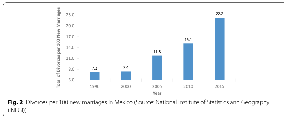
Table 5 Divorce rates by state—total number of divorces per 1000 people