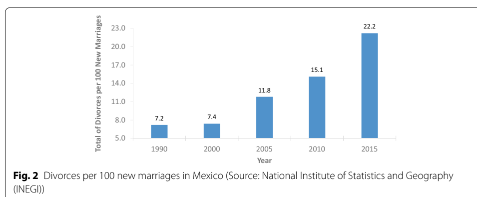
Table 5 Divorce rates by state—total number of divorces per 1000 people