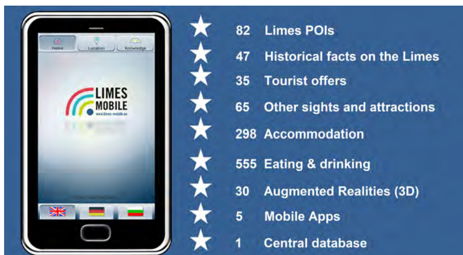
Fig. 3: The LIMES mobile app

With the digital museum guide, information can be presented more clearly, updated faster and conveyed more cost-effectively than by using conventional communication channels (e.g. brochures, panels).