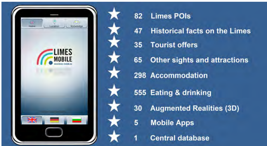
Fig. 3: The LIMES mobile app

With the digital museum guide, information can be presented more clearly, updated faster and conveyed more cost-effectively than by using conventional communication channels (e.g. brochures, panels).