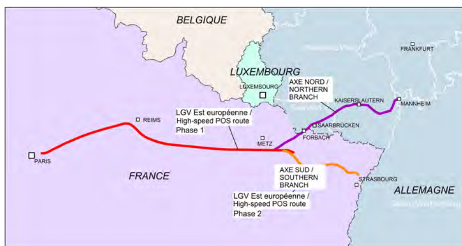
Fig. 1: Paris–Eastern France–Southwest Germany connection Southern and northern branch

The aim of the collaboration is to concentrate on the competitive expansion of the northern branch of the POS network compared to the well-developed southern branch via Strasbourg (see Fig. 1). To this end, a Steering Committee called ‘POS NORD Working Group’ was set up, consisting of the regional and national representatives of the two countries, as well as a grouping of regional chambers of commerce and industry and national railway companies. The latter is supported by a technical working group (SMA und Partner AG 2014a: 1 et seq.).