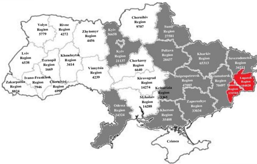
Figure 4. Number of calls from the regions of Ukraine to the Russian Federation on the night of 31.12.2017 to 1.01.2018