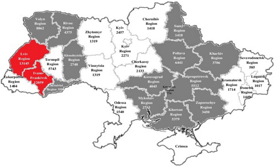
Figure 3. Number of calls from regions of Ukraine to Poland on the night of 31.12.2017 to 1.01.2018 Source: Vodafone Ukraine, 2018.

If we analyse the calls the different regions of Ukraine, it can be noted that the largest number was from the Lviv and Ivano-Frankivsk regions (13 145 and 12 059 respectively), and the least – from the Donetsk and Luhansk regions (Fig. 3).