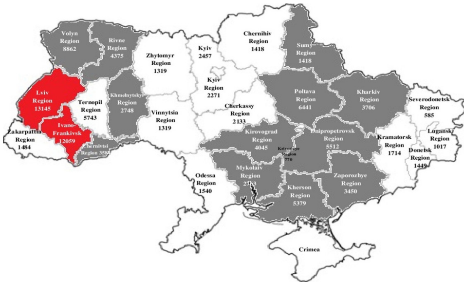
Figure 3. Number of calls from regions of Ukraine to Poland on the night of 31.12.2017 to 1.01.2018 Source: Vodafone Ukraine, 2018.

If we analyse the calls the different regions of Ukraine, it can be noted that the largest number was from the Lviv and Ivano-Frankivsk regions (13 145 and 12 059 respectively), and the least – from the Donetsk and Luhansk regions (Fig. 3).