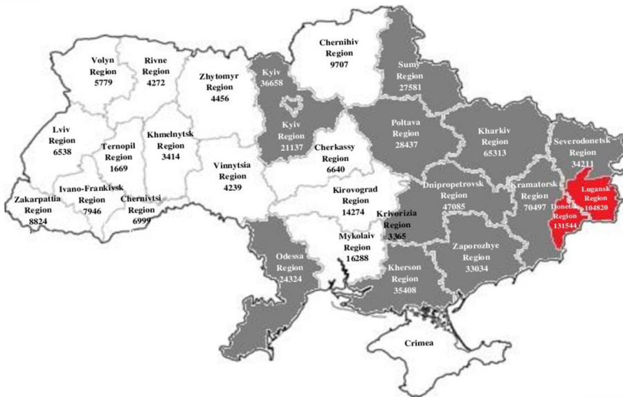
Figure 4. Number of calls from the regions of Ukraine to the Russian Federation on the night of 31.12.2017 to 1.01.2018 Source: Vodafone Ukraine, 2018.

Fig. 4 gives an idea of the number of phone calls made with New Year greetings to Russia divided into the regions of Ukraine. It may be noted that the largest number was from the Donetsk, Luhansk and Kharkiv regions (202 041, 139 031 and 65 313 respectively), and the least – from the Ternopil region (1 669). However, this information should be treated with caution, as the calls were made not only to their Ukrainian migrant relatives living in Poland and Russia but also to their Polish and Russian relatives and friends.