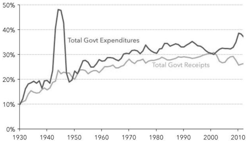
Figure 1. U.S. total government expenditures and receipts as a percentage of GDP, 1930–2012