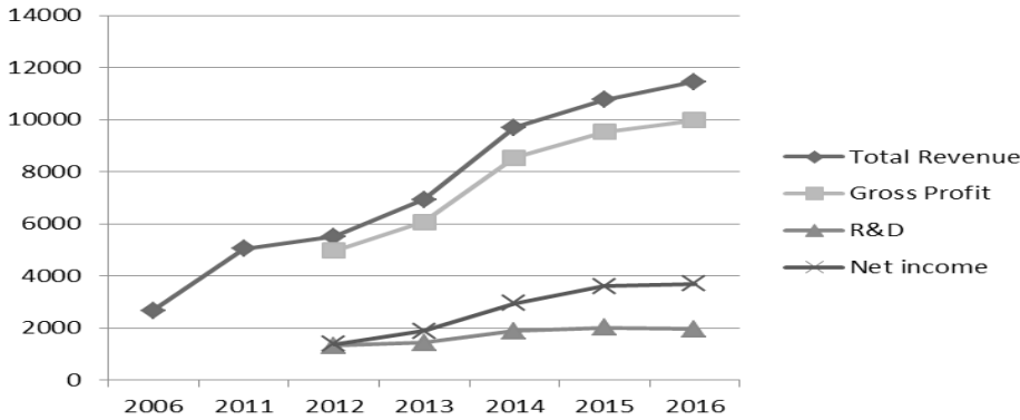
Graph 1. BIOGEN – Financial overview, 2006–2016, USD, Million

Graphs 1 and 2 present key financial information on the economic activities of BIOGEN, including some data on total revenue, gross profit, R&D expenditure, net income, profit margin, and profit per employee.