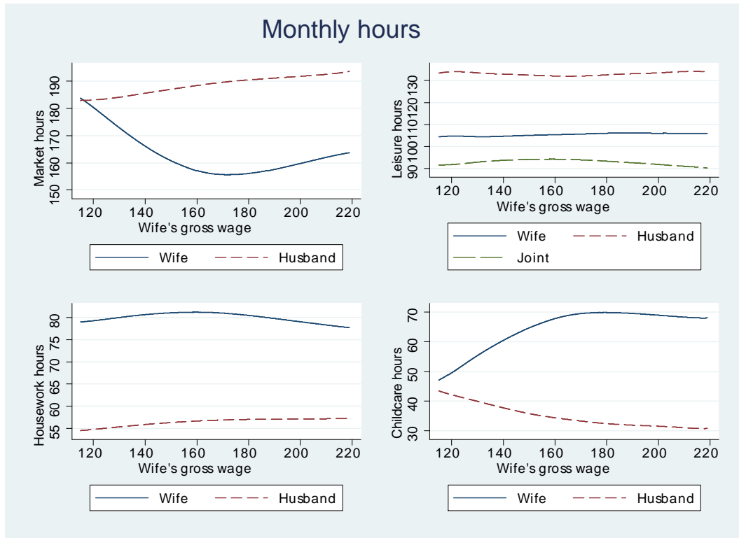
Figure 1: Time use variation with wife's wage.