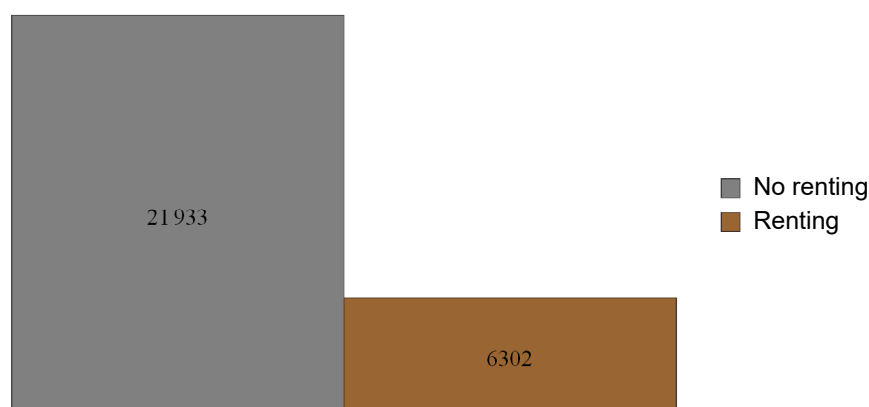
Figure 3. Histogram of the dependent variable.

Figure 3 shows a histogram of the dependent variable which reflects a significant imbalance in the two categories of outcome considered.