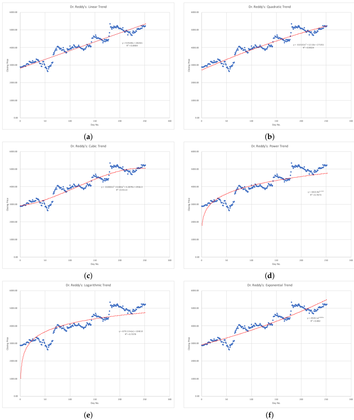
Figure 1. Trend lines for Dr. Reddy's Lab (Pharma Sector): January–December 2020.

The equation of the fitted trend line, R-squared error, RMS Error were calculated and are presented in Table 1. The same process was carried out for all the 20 companies, but for the sake of brevity, we display only one.