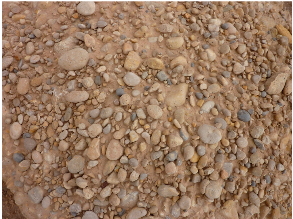
Figure 3. Stony desert pavement as a result of deflation in Southwest Iran, south of Ahwaz.