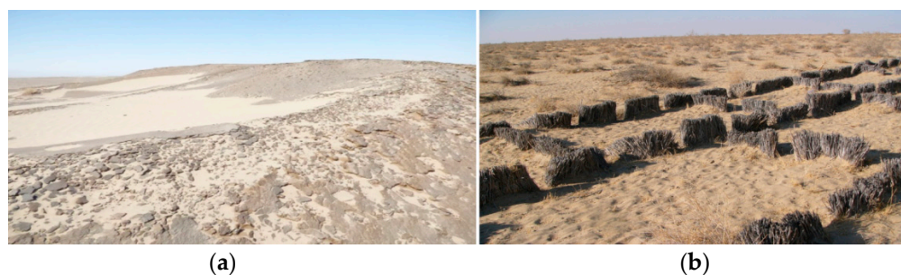
Figure 6. (a) Oil mulch application for dune stabilization in Sistan Plain (Iran); (b) Sand catchers for sand surface stabilization in the eastern Karakum Desert, Turkmenistan.

desiccated Aral Sea, increased when they received additional water during the first year after planting (Matsui et al. 2018). Such planted shelterbelts are often used along both sides of desert roads, for example, the desert roads crossing the Taklimakan Desert in Xinjiang, China. This is made possible by utilizing the huge groundwater aquifers below the sand dunes of the Taklimakan Desert for drip irrigation of the shelterbelts. For improving the initial survival chances of newly planted but locally adapted plants, the application of additional water absorbers can be beneficial. A project in the Aralkum Desert (Kuzmina and Treshkin 2012) used such absorbers, comparable to the material found in baby diapers, in a sand dune area to help the planted vegetation overcome the soil moisture deficit during the dry season and to ensure survival during the first hard years. If planting is not a viable option, then fixating the soil surfaces with oil mulch products (Figure 6a) or water-soluble surfactants like PAMs might be (Genis et al. 2013; Kuldasheva et al. 2020). However, the application of chemical substances can lead to harmful side effects on the soil microorganisms and the desert fauna and needs to be carefully evaluated before implementation.