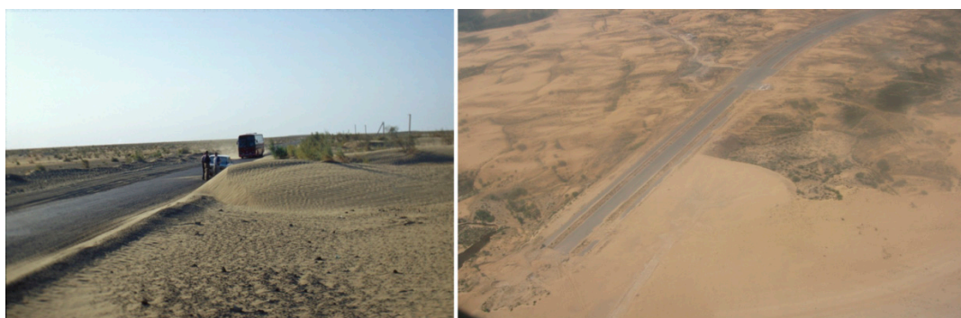
Figure 5. Sanding up of traffic lanes, here: Kyzyl Kum transit road, 120 km north of Bukhara, Uzbekistan.

The corresponding effects of wind-blown deposited (finer) dust are the same as for sand, with exception of the abrasion effects on the vegetation. Instead, the finer dust can congest the vegetation stomata and reduce functionality by covering leaves with a layer of fine sediment. Hirano et al. (1995) have shown for beans and pickles that dust deposition amounts of 1 g/month can already have significant negative effects on plant physiology. Dust on leaves may increase the leaves' temperature because of the increased absorption of infrared radiation. Hirano et al. (1995) expressed that the absorption intensity depends on the color of the dust. However, they also described a shading effect, which increases with decreasing grain size. This shading also negatively affects the photosynthesis efficiency and the primary production of the vegetation. Leaves' stomata can get blocked by fine dust particles as well, which prevents them from fully closing during the day increasing transpiration losses and lowering water use efficiency, amplifying the vegetation's water stress. Contrary to these findings, Sharifi et al. (1997) detected reduced transpiration rates caused by dust-covered leaves. These opposite effects between dust cover and transpiration require more detailed comparative analyses.