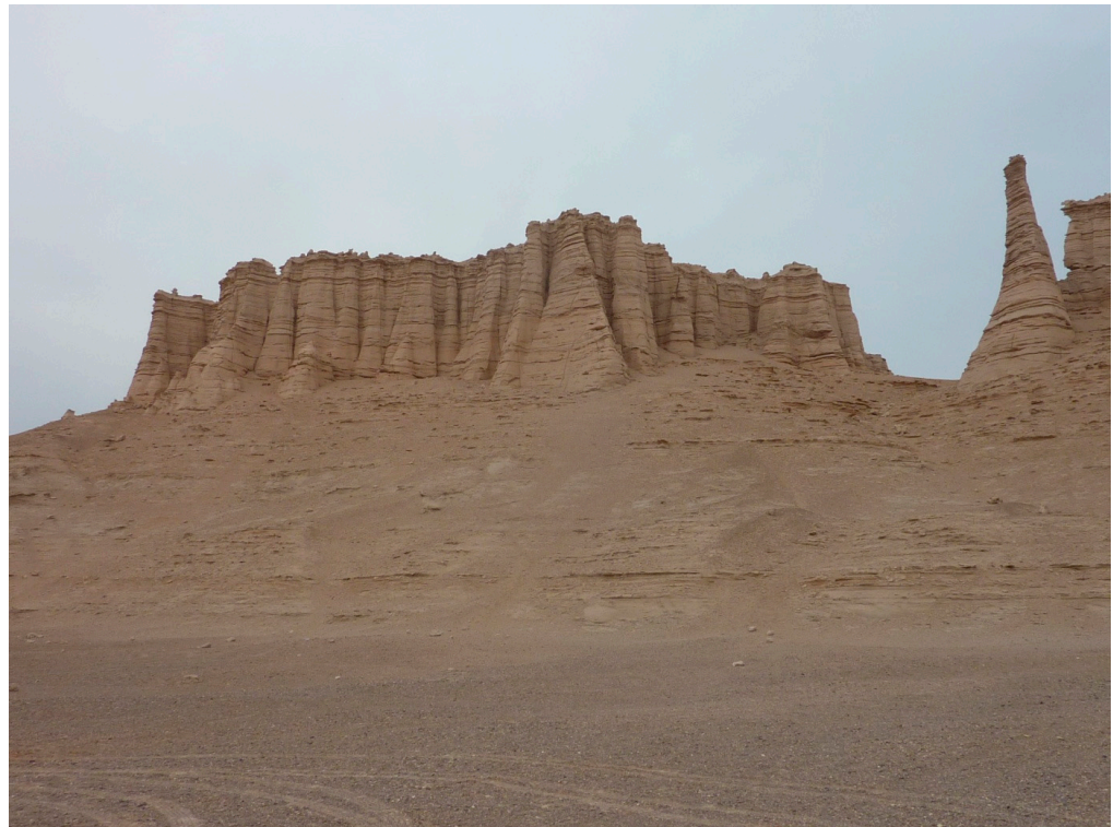
Figure 4. Yardangs in the so-called Devils City, west of Hami, Xinjiang, China.

Typical phenomena of (coarser) sand deposition in sink or deposition areas are: