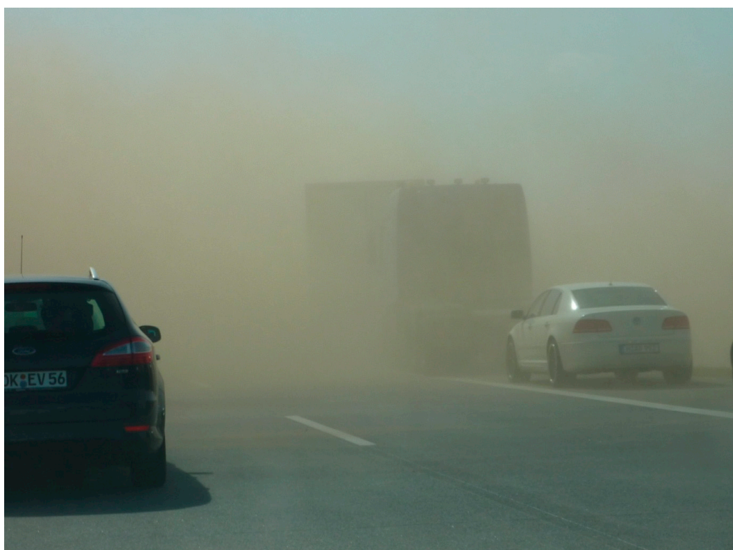
Figure 2. Dust storm on the Highway (Autobahn) 19, south of Rostock, 8 April 2011.

2010 (Kononov et al. 2011), land use activities, e.g., the US Dust Bowl (McLeman et al. 2014), and other reasons. The reduced visibility and the high particle concentration may affect air transport in general. Continuous delivery of high particle concentration in diverse atmospheric layers as it occurs for example in combination with volcanic eruptions furthermore can be especially dangerous for jet planes and interrupt air traffic for several days, as in the case of the Eyjafjallajökul volcano eruption on Iceland in 2010. Reduced visibility through dust storms also occurs in the near-surface boundary layer and affect road traffic, as one of the authors witnessed on a highway south of Rostock, Germany, on 8 April 2011 (Figure 2), where eight people died, 41 were injured, and 150 cars were damaged because of sudden and dramatic reduction of visibility.