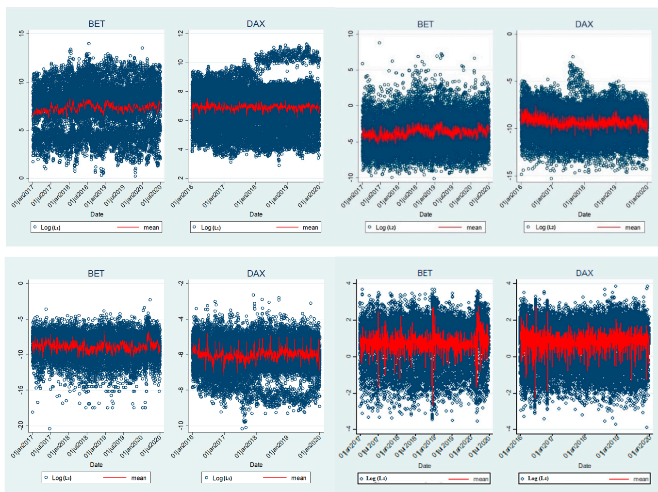
Figure 1. Dynamics of liquidity ratios at company level and their average throughout the analysis period. Notes: BET-Romanian blue-chip index; DAX-German blue-chip index; L1-Hui-Heubel liquidity ratio; L2-Amihud ratio; L3-Turnover ratio; L4-Corwin-Schultz bid-ask spread.

When referring to the results obtained for the German stock market, the illiquidity Amihud ratio has decreased while the general liquidity ratio has increased in the analysed period. The illiquidity Hui-Heubel ratio shows a decrease only in the first year of implementation of MiFID II. The only ratio that shows a decrease of the liquidity is the Corwin-Schultz bid-ask spread, which increases over the last two considered periods of time (1.5 years and 2 years after the implementation of MiFID II).