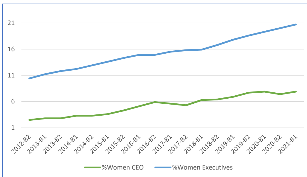
Figure 2. Percentages of women CEO and executives—EU28.

The sport and leisure sector is among the most vibrant and financially sound areas of the EU economy, which managed to generate almost EUR 28 billion in revenues during 2019, experiencing a growth of up to 3% within a single year (Deloitte 2020). This market growth was attributed to a 2.5% increase in the number of clubs across EU countries and club members increased by 1.5% during the pre-pandemic year. According to Deloitte (2020), Europe is the second-largest sport and leisure market globally, being slightly surpassed by the US, which managed to generate EUR 28.6 billion in revenues during 2019.