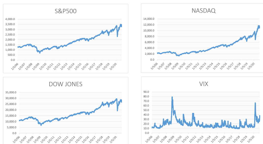
Figure 1. Stock price indices during the examined period. Note: Time evolution of the main indices of interest.