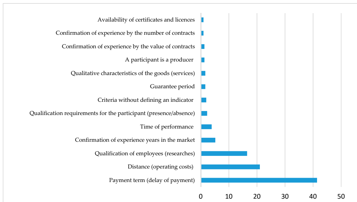
Figure 1. Structure of non-price criteria specified by the customer in the procurement of goods announcement in 2019.

The main non-price criterion for the purchase of goods is the delay of payment that, in the percentage terms is 41% (Figure 1), including the term more than 180 days from the date of delivery of goods, receiving of services, execution of tenders, which is a negative phenomenon of the financing of public procurement.