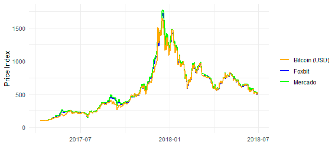
Figure 1. Evolution of Bitcoin prices over time.

Figure 1 identifies the evolution of the prices for Bitcoin in both Brazilian institutions and for the Bitcoin price in USD. In order to make the prices comparable, we transformed them into price indices with the same basis. Nonetheless, Foxbit shows significant price divergence some days before July 2017, and before January 2018 we can see that both Brazilian prices show some divergence until they reach the price spike. Thereafter that, prices seem to become closer towards the end of the sample.