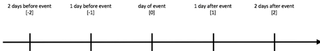
Figure 1. Time window of the event study.

The time window investigated ranges from two days before the event indicated by [-2] to two days thereafter indicated by [2]. The time window of the event study and its descriptions are shown in Figure 1.