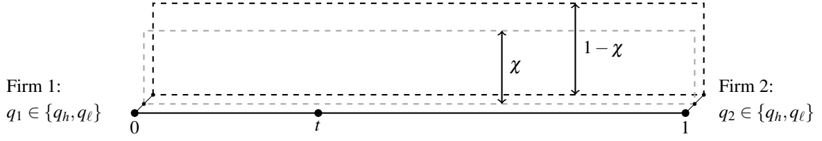
Figure 3 Cursed and rational consumers along a Hotelling line

Firms' incentives to reveal quality are as in our main model. A firm discloses if and only if its quality is high. To assess the effect of consumer protection policies we can therefore again focus on the case of vertical differentiation. 18 In the equilibrium we construct, both the high-quality and the low-quality firm now serve some rational and some cursed consumers. Nonetheless, similar trade-offs as in the main model arise.