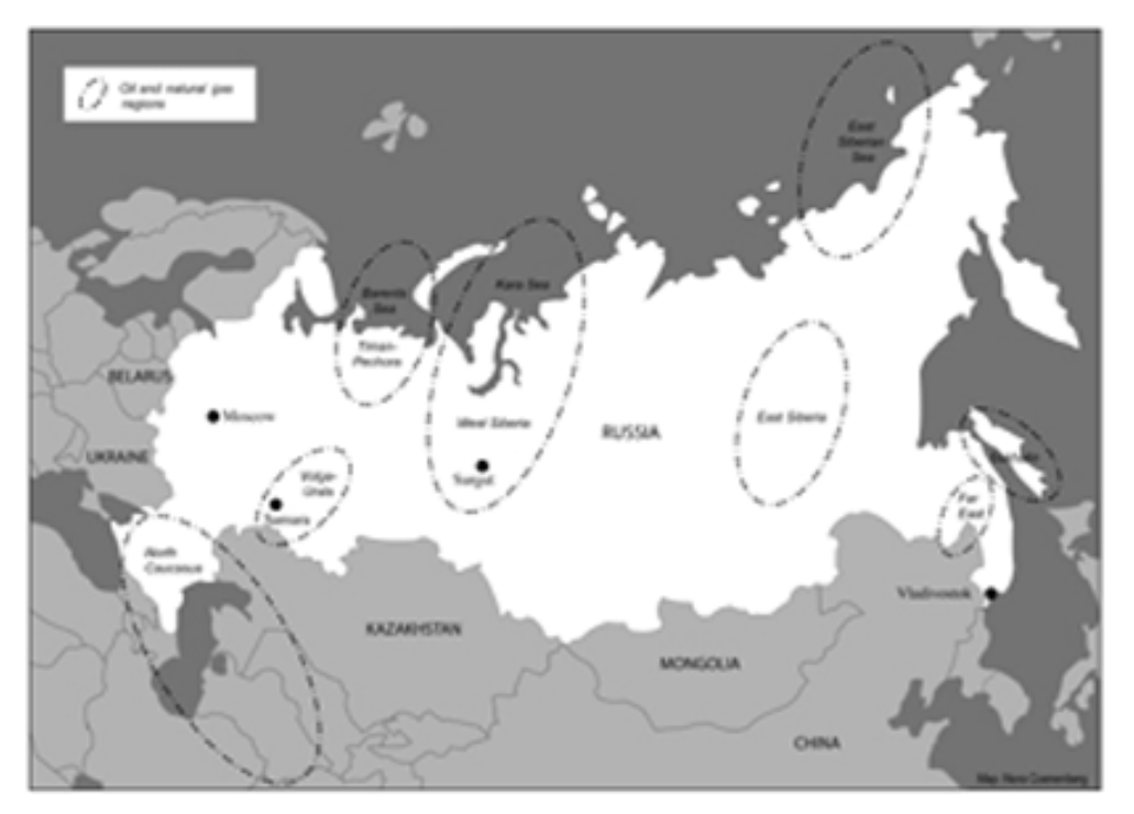
Map 3 Oil and gas producing regions