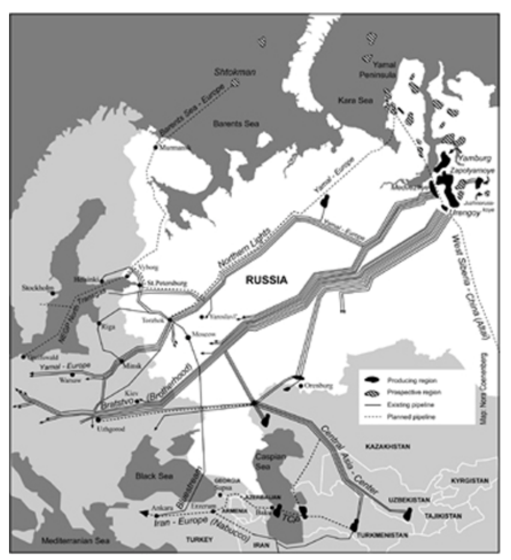
Map 1 Gas pipelines to the West

Moreover, a progressing geographical diversification of European gas imports is brought about by an increased use of LNG, although this does not apply to all European regions equally. LNG will gain importance above all in Southern Europe as well as in France and Britain, while increasing imports will make Germany and the countries of Eastern Europe even more dependent on gas coming in pipelines from Russia.