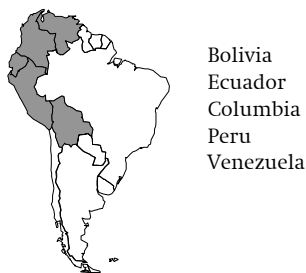
Map 2 The Andean Community

Such a scenario affects the EU particularly strongly, because Union's strategy is one of subregional cooperation. Homogeneity and harmonization within Latin America are becoming increasingly threatened. As a result, the EU is forced into a fundamental reconsideration of its policies towards Latin America. The European concept of interregionalism as the standard pattern for cooperation with Latin America runs into limits set by the redistribution of leadership roles and the disintegration of the Andean Community. The drawbacks of the concept of group dialogue as practiced to date are particularly obvious in cooperation with the Central American states in the San José process and the Caribbean members of the ACP group. The EU Commission is often no longer able to attract representatives of