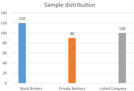
Figure 2. Sample distribution among different professions

In this research, behavioural biases are taken as the dependent variable, which included representativeness, overconfidence, anchoring, gambler's fallacy, availability bias, loss aversion, regret aversion, mental accounting, and herding bias. The questions related to these biases contain 29 statements, measured using the ordinal five-Point Likert Scale (Strongly disagree to Strongly Agree).