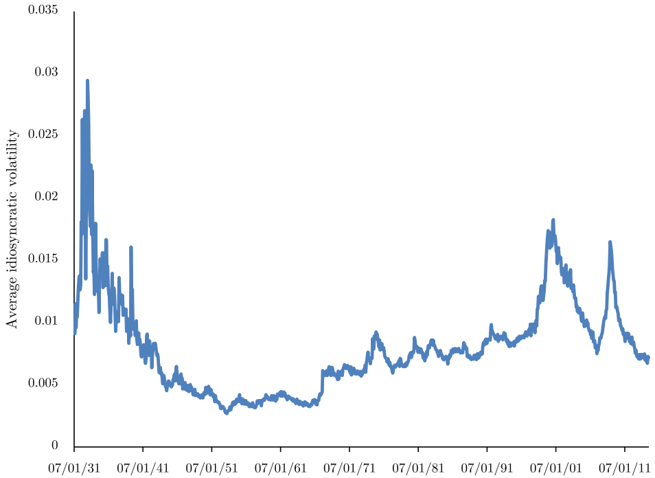
FIGURE 1. We compute the value-weighted average idiosyncratic volatility for small and large capitalization stocks, and then calculate a simple average of the two to obtain average idiosyncratic volatility for each month. We use NYSE median breaks to separate small and large cap stocks.

diversification, which in turn, varies with average idiosyncratic volatility. This leads to an asset pricing model where the time series variation in the idiosyncratic risk premium is linked to average idiosyncratic volatility. We illustrate this in Figure 2, highlighting the difference between Merton's (1987) formulation and our modification.