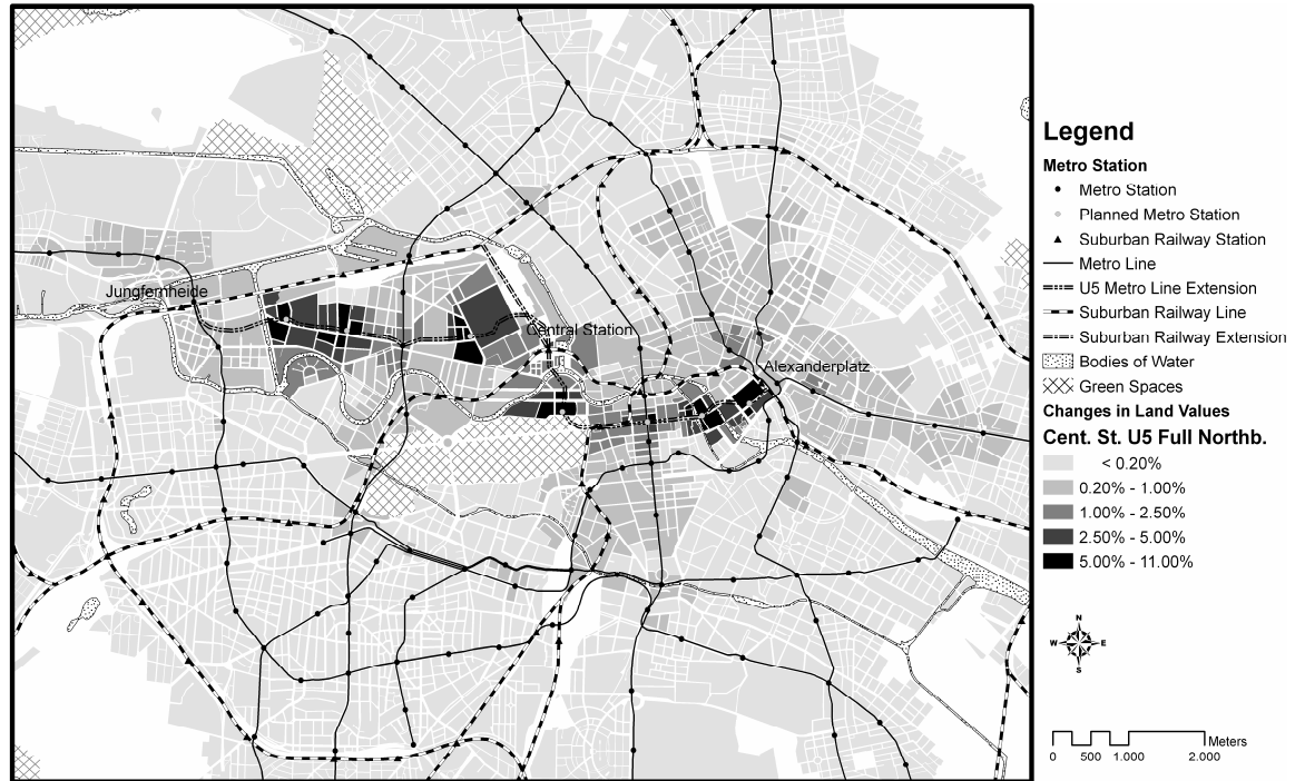
Fig. 4 Effects of Nothbound, Southbound and Westbound Extensions

Notes: Map created on the basis of the "City and Environment Information System" of the Senate Department (SENATSV ERWALTUNG FÜR STADTENTWICKLUNG BERLIN, 2006b),