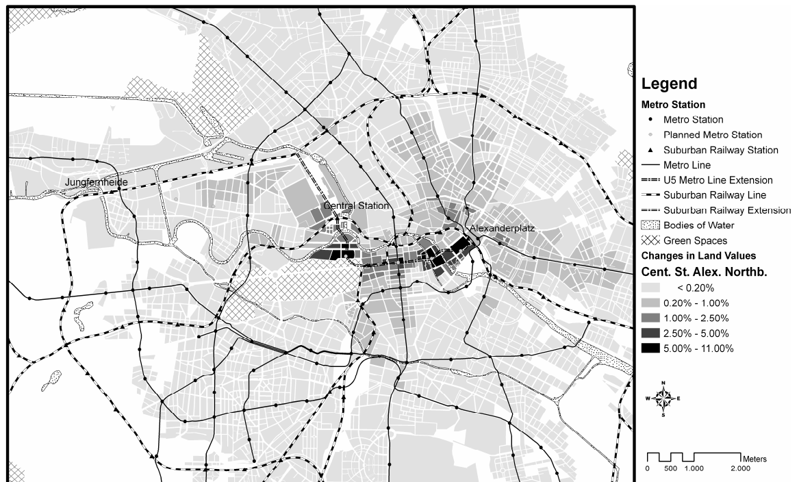
Fig. 3 Effects of Northbound and Eastbound Extensions

Notes: Map created on the basis of the "City and Environment Information System" of the Senate Department (SENATSVORWALTUNG FÜR STADTENTWICKLUNG BERLIN, 2006b).