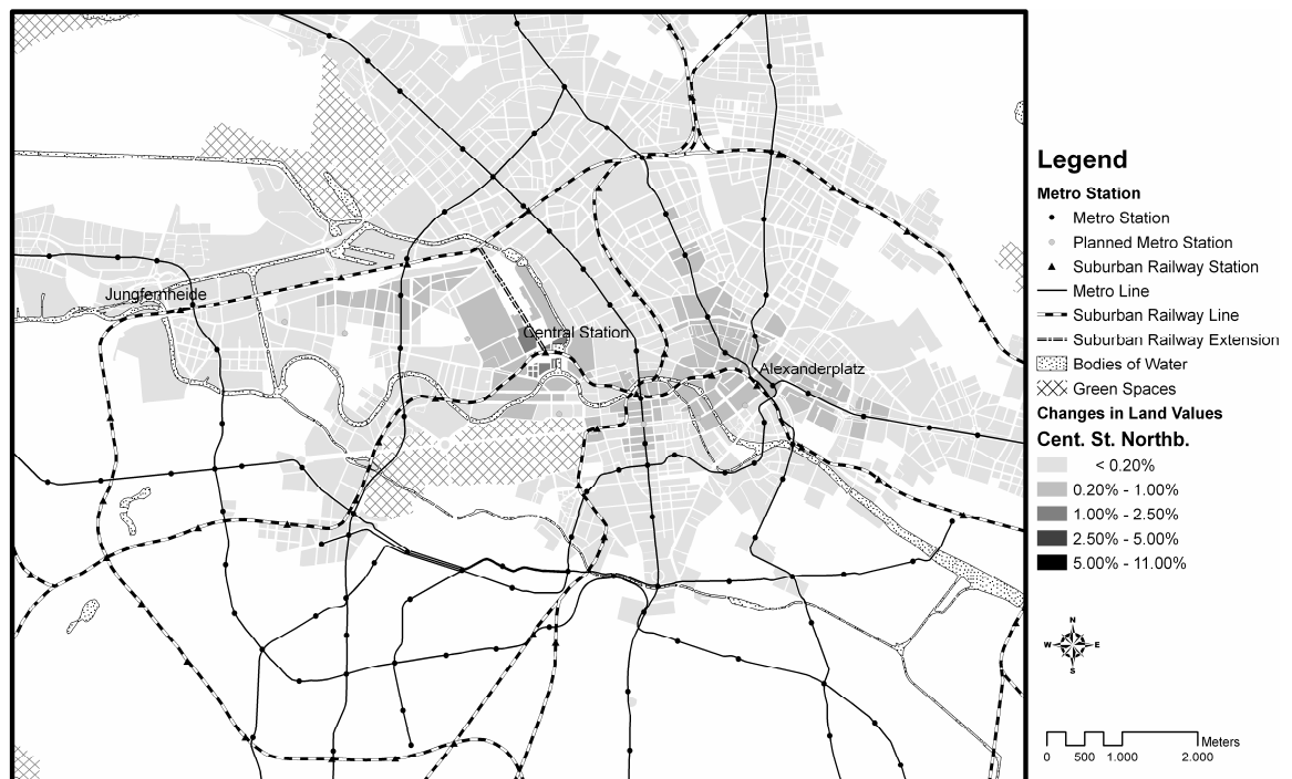
Fig. 2 Effects of Northbound Extension

Notes: Map created on the basis of the "City and Environment Information System" of the Senate Department (SENATSV ERWALTUNG FÜR STADTENTWICKLUNG BERLIN, 2006b).