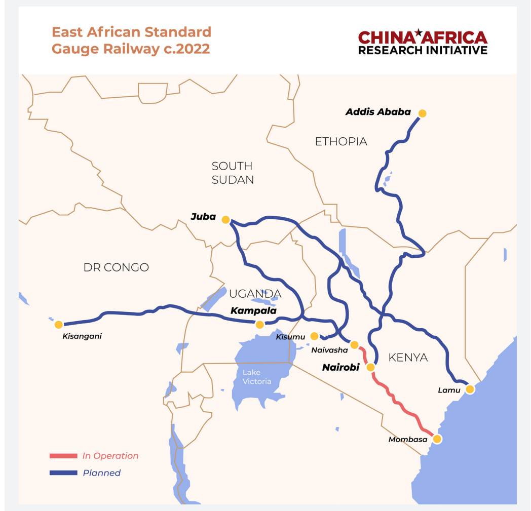
Figure 1: Map East African SGR ®

In keeping with the United Nations' 2030 Strategic Development Goals, Kenya's government launched its Vision 2030 strategic plan in 2008. 13 In January 2009, the East African Railways Master Plan for the