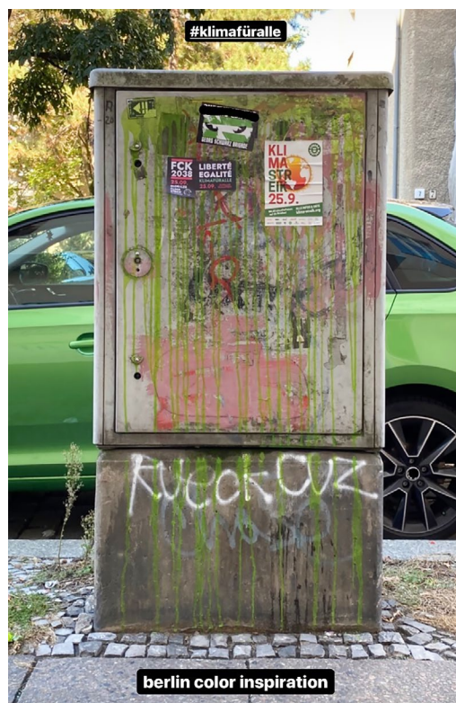
Figure 2. Screenshot of a post referencing Berlin.

Mediated spaces – This section will look further into the ways that urban spaces are mediated. The post below (Figure 2), by a sustainable Berlin-based designer, is an example of how the city is represented online. It features a familiar urban scene. Perhaps the designer took the photo on her way to work or during another everyday situation. The