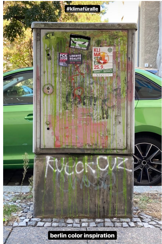
Figure 2. Screenshot of a post referencing Berlin.

Mediated spaces – This section will look further into the ways that urban spaces are mediated. The post below (Figure 2), by a sustainable Berlin-based designer, is an example of how the city is represented online. It features a familiar urban scene. Perhaps the designer took the photo on her way to work or during another everyday situation. The