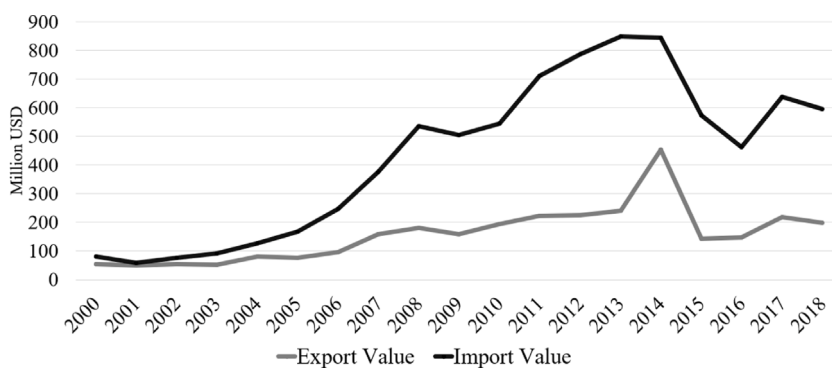
Fig. 1. Evolution of trade in agricultural goods, 2000–2018. With regards to discussions related to trade, all individual products belonging to product groups with 2-digit HTS codes between 01 and 24 are accepted as agricultural goods.