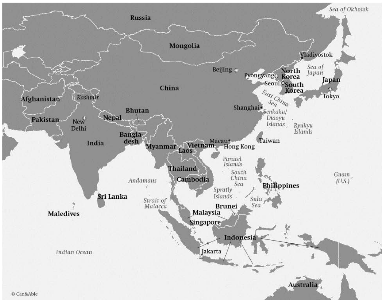
Map 1 Asia