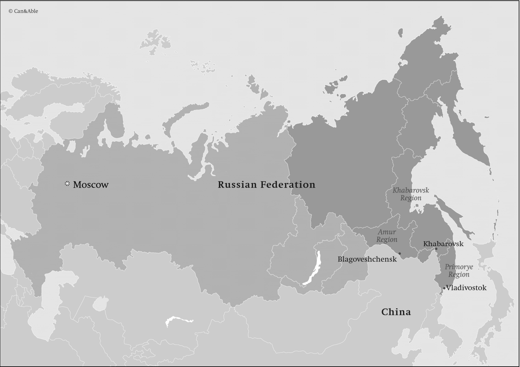
Map: Russia's Far East