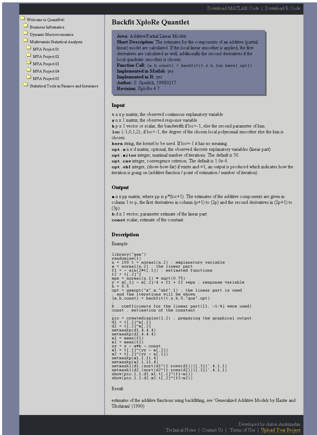
Figure 3: The actual look of QuantNet