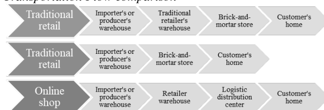
Figure 1 Transportation Flow comparison

In several cases, the step of the traditional retailer’s warehouse is skipped, and goods are directly transported to the store. With the use of real data from a logistics service provider, the calculations for the flows become more realistic. For calculating the emissions, two locations of a customer’s house will be assumed: Flensburg in the far north and Kempten in the south of Germany. This assumption will provide the chance to determine whether the customer’s location influences the emissions produced, especially if the researched retailer has only one warehouse to ship or distribute goods from to its stores. The results will further broaden the question of the optimal location of warehouses and stores to produce fewer emissions.