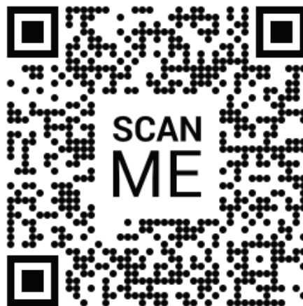
Figure 2: QR code linking to the digital Product Passport

that we use in our example can be encoded into a 2D code. Figure 2 shows the respective encoding of the DID as a QR code. Using this code on product packaging can link the physical product to the digital product passport. It is also possible to use Concise Binary Object Representation based Serialization for Linked Data (CBOR-LD) 16 for the encoding and thus enlarge the information in the QR code and even make it verifiable. This technology is used for example in the W3C draft for vaccination credentials 17 .