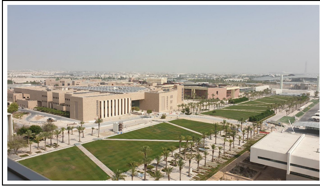
Figure 2. Education City, Qatar.

DIAC is the larger of the two zones, covering roughly 1.7 km 2 on the South-Eastern fringes of Dubai and hosting the majority of the offshore campuses of the city. According to the managing organisation, both zones together hosted over 27,000 students with 150 nationalities in the academic year 2018/2019 (TECOM Group, n.d.).