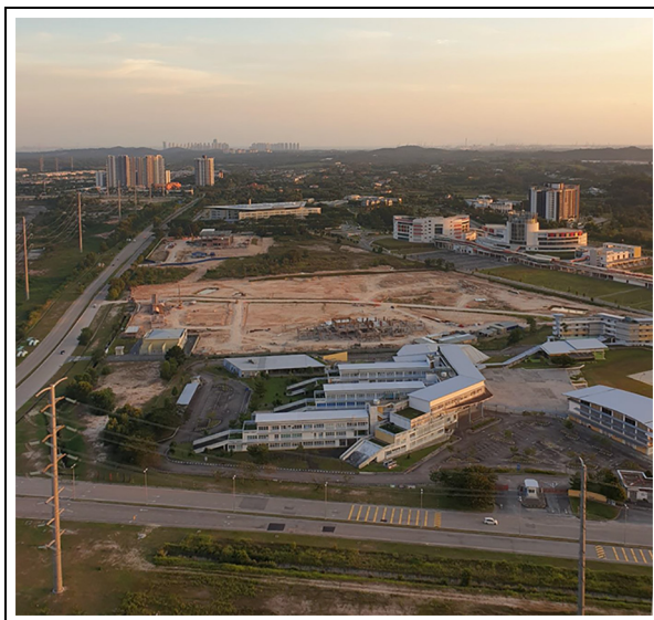
Figure 3. EduCity Iskandar, Malaysia.

development through a knowledge economy. The Medine Group is indeed committed towards providing a smart city whose main driver would be Education' (Uniciti Education Hub, 2018). While the notion of 'smart city' usually centers around ideas of entire cities that are technologically networked and sustainably designed, here, the developers discursively link it to the individual education zone and the production of a 'smart' urban population.