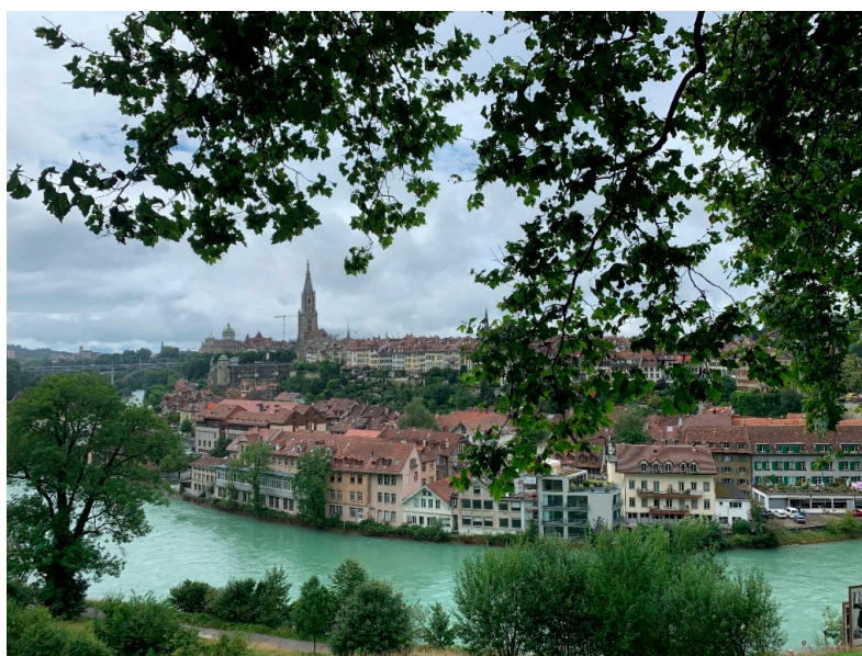
Figure 1. City of Bern.

Both cities place a high value on preserving their historical cityscape. Therefore, both host large-scale ensembles and monuments on their territory that are recognized as UNESCO World Heritage Sites. The medieval city center of Bern was added to the UNESCO World Heritage list in 1983. Potsdam's and Berlin's Prussian gardens and palaces were awarded the same status in 1990. Besides the significance of the UNESCO World Heritage, Bern and Potsdam share other characteristics (see Figures 1 and 2). They are mid-sized cities of roughly the same population size located in advanced democracies in Central Europe. Both are university cities with a strong and diversified research environment and an economy that is dominated by service industries. Furthermore, both cities have acquired the reputation of being forerunners in climate governance within their countries [54] (see Table 2).