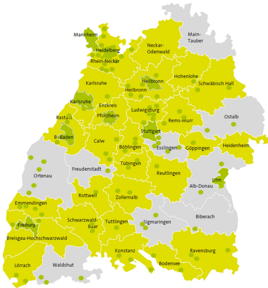
Fig. 2 Map of the German federal state of Baden-Wuerttemberg with areas of responsibility, (dark green: municipal responsibility; light green: responsibility at county level; grey: regions without registered municipal climate action managers) extract from KEA (2021)

2021). Across the state, there are about 90 climate action managers registered in the KEA network (KEA 2021). Thirty of them participated in the workshop and are altogether responsible for a total of 105 mainly small and medium-sized cities. Figure 2 illustrates their responsibilities according at the municipal level (dark green) and at the county level (light green). In the grey regions there are no climate protection managers registered with the KEA network.