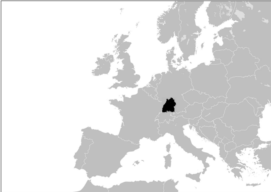
Fig. 1 The location of the German state of Baden-Wuerttemberg on the map of Europe

The aim of our work is to develop a transferable framework for the initiation and establishment of regional networks for climate change adaptation in SMCs. In this respect, we first determine which key actors most effectively support adaptation measures in SMCs (hereinafter question 1). Next, we question how a regional network for SMCs can be systematically designed and established (hereinafter question 2). Our study is based on the hypothesis that regional networks for municipal climate adaptation can effectively promote climate change adaptation practices in SMCs.