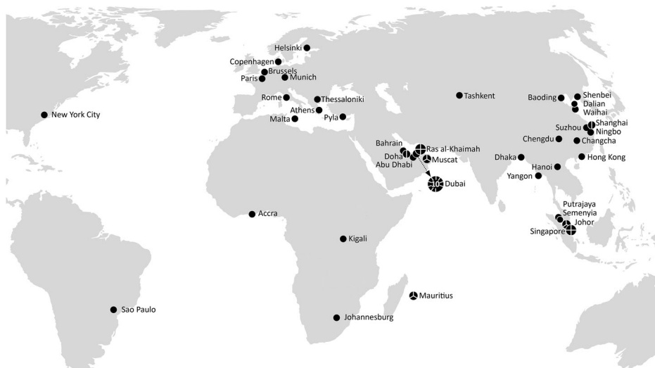
Figure 1. Map of the UK's international branch campuses.

universities explain in interviews that one important rationale for campus development offshore is to circumvent restrictions placed by immigration regulation in the home territory and by being able to charge independent prices which are not set by the UK government.