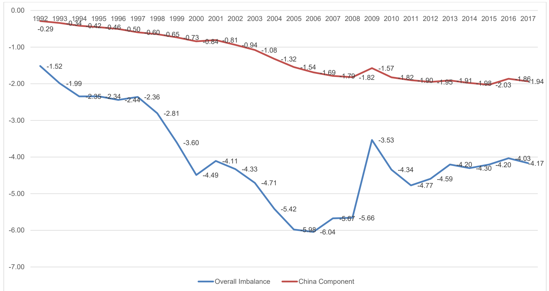
Figure 2. USA: Trade Balance in Goods (% of GDP)