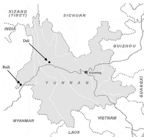
Figure 3. Yunnan's prefectures and regions.

Data collection took place between June and August 2009. A random sampling was used to select participants from two communities (one urban and one rural) in each of the three municipalities. With the assistance of the residential committee of the selected urban communities, the local youth leaders of the sampled rural communities, a list of adolescents and youth who were out-of-school at the time of data collection was compiled. From this list, every two persons on the list were randomly selected for the study, with an intended a sex ratio of three males to one female, which was consistent with the sex ratio of