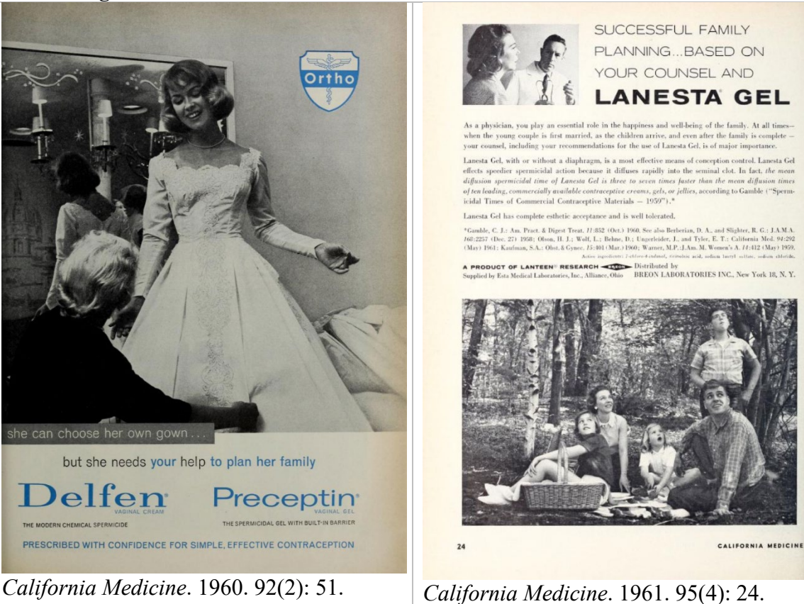
Figure A2: Examples of booths with representatives of contraceptive products at the annual meetings of the California State Medical Association, prior to the repeal of the state's advertising and sales ban