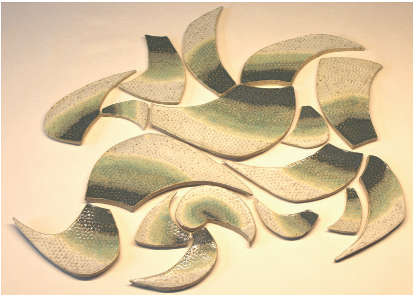
Fig. 2: The tribal

A further interpretation focuses on the chaotic position of the individual pieces, i.e. on a state of entropy, which describes the inequality and disorder within a system. An intensification of this tendency towards the expansion of free spaces between the segments could then be interpreted as a disturbance or danger within the community, which could lead to segregation and separation and would possibly require (planning) control.