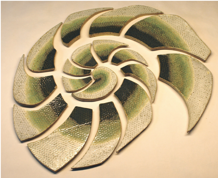
Fig. 1: The snail shell

If this perspective is changed, the individual fragments of the snail shell can also alternatively be interpreted as clods. Then the individual clods stand for individual living environments in neighbourhoods or built-up areas. As a whole, they constitute the snail shell, representing the community of the suburban space under examination. This interpretation focuses on the spatially manifested composition of suburbia. Around the unequivocal middle (centre), the snail shell (city/municipality) grows with each structural, functional or social expansion (by the addition of a new clod or its loss in the case of shrinkage). Variations in size and composition can be designed by placing individual clods closer to or further away from each other, in order to indicate structural and social proximity or distance between the inhabitants. This could also enable conclusions to be drawn about social cohesion. In addition, the spiral shape of the snail shell respects the transformation potential of suburbia as open, unfinished spaces which continue to (be able to) change.