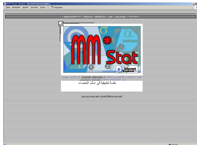
Figure 1: Arabic MM*STAT - Cover Page

Figure 1 presents Arabic MM*STAT - Cover Page. Figure 2 presents Arabic MM*STAT - Content Page. The user can enter the courses topics via a list of contents and can go to any desired topic or course chapter. By hovering the mouse pointer over a selected course file for a few seconds will appear to identify the course topic.