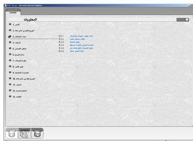
Figure 2: Arabic MM*STAT - Content Page

Figure 3 shows a graphical user interface (GUI) of a statistic topic in Arabic MM*STAT