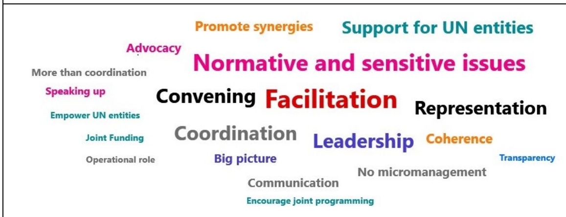
Figure 2: Word cloud on coded perceptions of UN staff on the role of the Resident Coordinator

Note: The size of the words indicates the number of interviewees that support a statement.