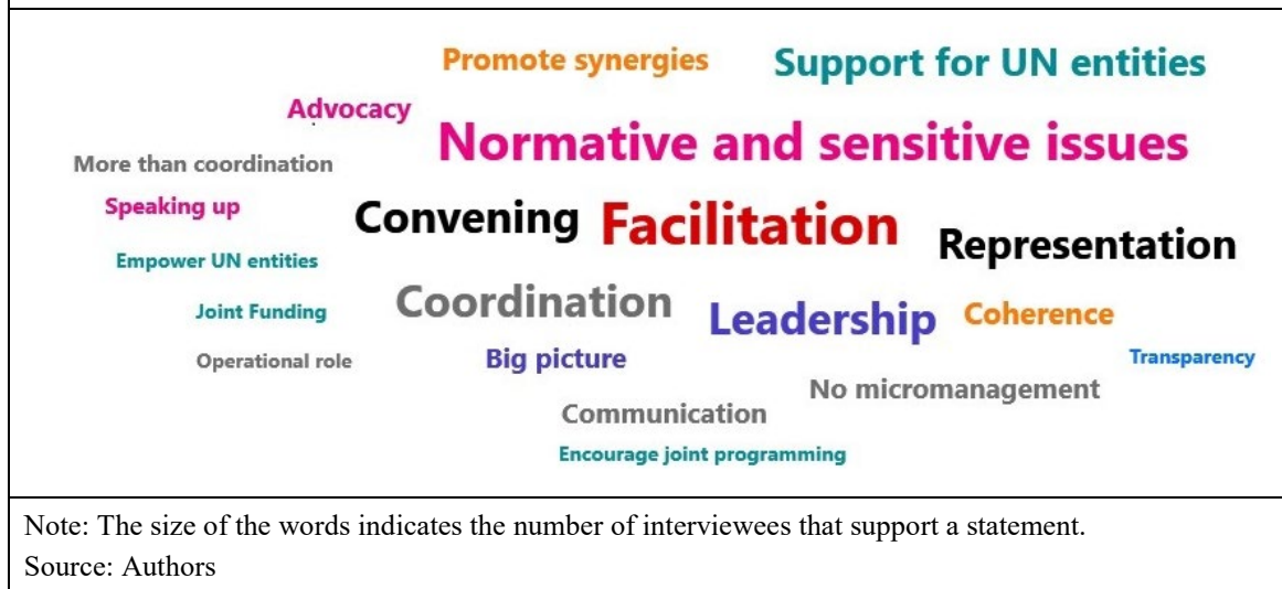
Figure 2: Word cloud on coded perceptions of UN staff on the role of the Resident Coordinator

Being in charge of the revamped programming cycles, and reinforced by the revised MAF, RCs, together with the newly capacitated RC Offices, helped steer country teams towards a more cooperative and coherent approach. However, several RCs reflected that this remains a difficult task that involves struggles among entities, for example, with regard to the prominence of entity-specific mandates in the defined outcomes or with regard to visibility.