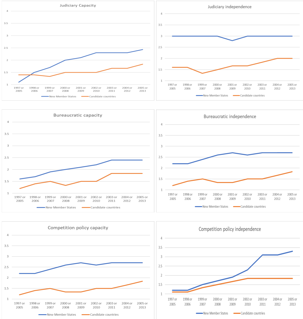
Figure 1. The Institutional Lift from The Prospect of EU Membership: Yearly Averages for New Member States (1997-2005) and Candidate Countries (2005-2013) of Six Key De Jure (Independence) and De Facto (Capacity) Institutional Dimensions