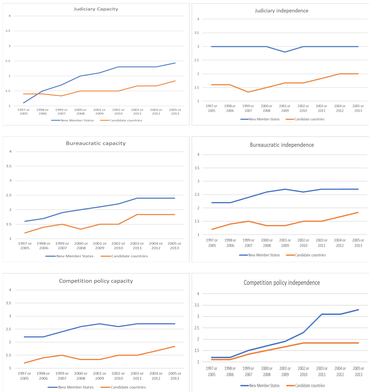
Figure 1. The Institutional Lift from The Prospect of EU Membership: Yearly Averages for New Member States (1997-2005) and Candidate Countries (2005-2013) of Six Key De Jure (Independence) and De Facto (Capacity) Institutional Dimensions