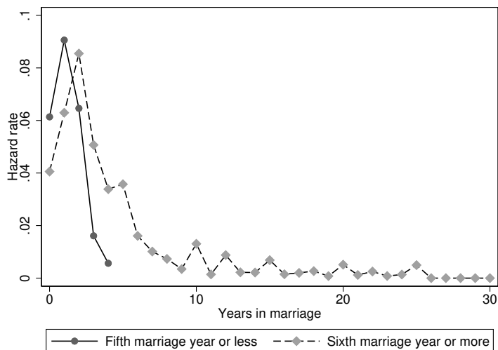
FIGURE 1: Risk of first violence, by years in marriage

The hazard rates show the number of women who experience violence for the first time in a given marriage year, divided by the number of women at risk that marriage year.