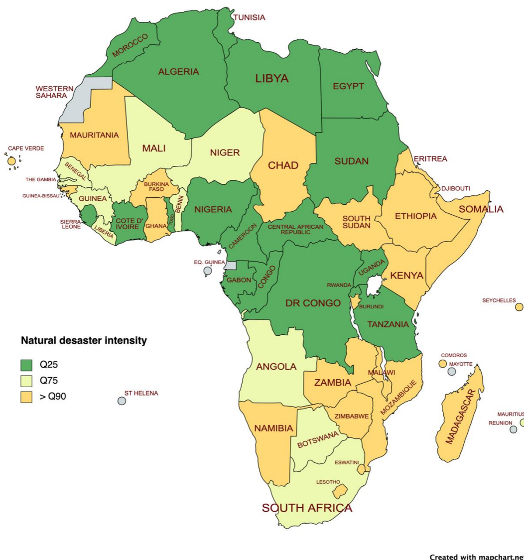
Table 3 : Distribution of disaster intensity in Africa (1980-2020)