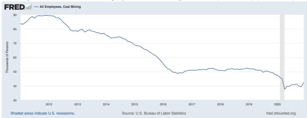
Graph 1 - Total amount of employees in coal mining in the US (2011-2020) (Thousands)

Source: Federal Reserve Economic Data (FRED), https://fred.stlouisfed.org/series/CEU1021210001